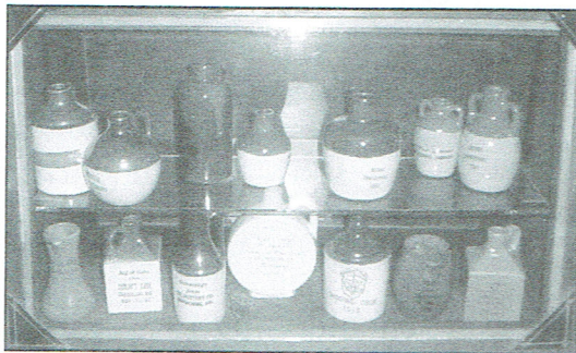
Mostly Christmas jugs

Here are a few pictures of my collection. I also collect antique fruit jars as is very evident in the pictures.