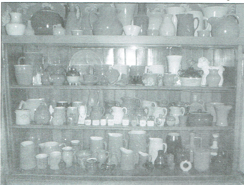
Hand turned and many other pieces

I purchased a perfectly matched pair of baby shoes separately, about 250 miles apart over two weekends in Minnesota, I picked up a hand turned pitcher at a tiny show that was misidentified