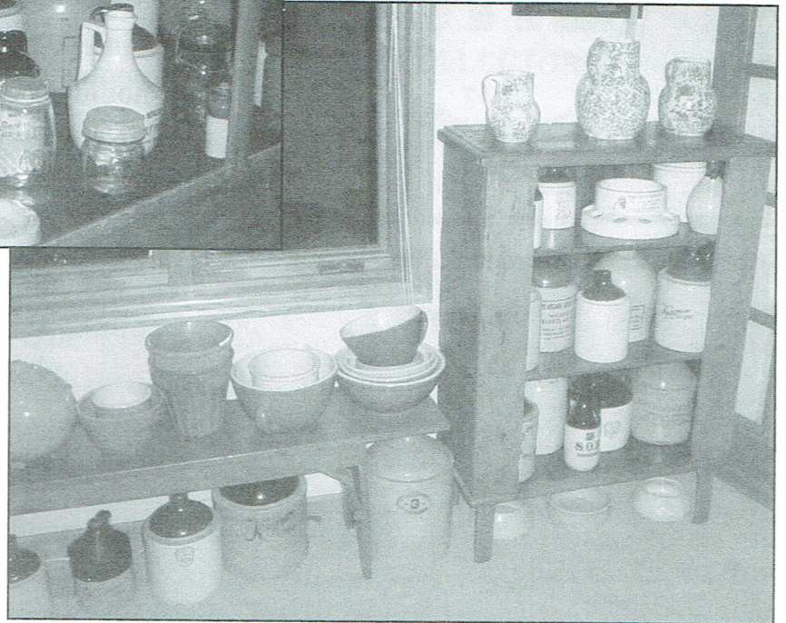
Bulbous pitchers, Krogman jugs and Evansville jugs