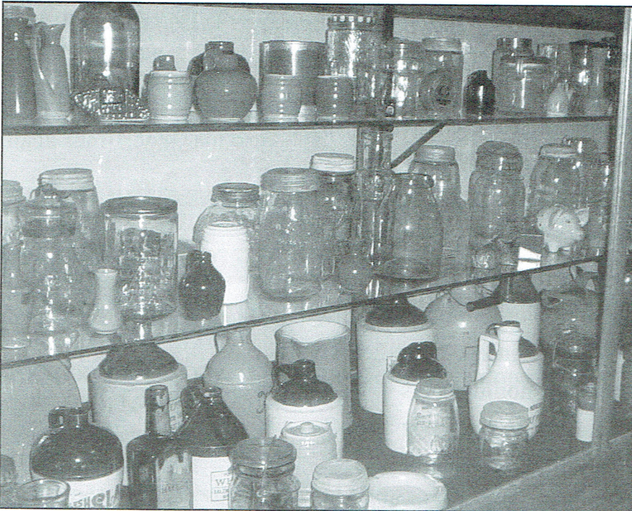
Jars and Uhl

A few years ago I started a Yahoo page for Uhl collectors to let people share their pictures and stories. The URL is: http://groups.yahoo.com/group/collecting_uhl_pottery/ .